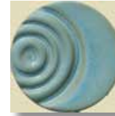
1239 Frosted Turquoise

These glazes can be used on most of our Cone 6 clay bodies. Standard Ceramics recommends that you test them with your application and firing methods. By adding various percentages of oxides and stains, you will command an infinite range of colors. All glazes are in powdered form.