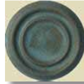
1236 Frosted Moss