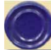
NLM20 Dark Blue