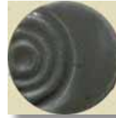
1237 Midnight Moss