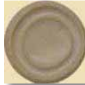
1065 Waxy White