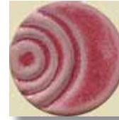
1238 Frosted Cherry