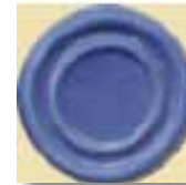
NLM24 Medium Blue