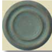
1233 Pale Seaweed