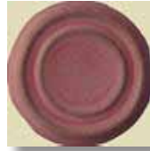
1234 Mottled Pink