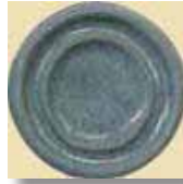
1216 Stone Blue