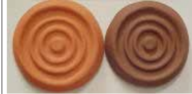
(C/06 Ox. left, C/2 Ox. right)