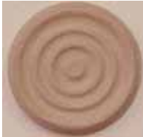
(C/04 Ox. shown)

A low fire clay with a very smooth and light brown body. This potters clay works well with low fire glazes.