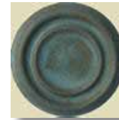
1236 Frosted Moss