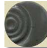
1237 Midnight Moss