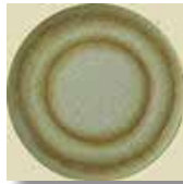
1232 Hay Bale Yellow