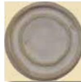
1049 Stony White