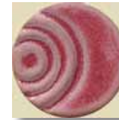
1238 Frosted Cherry