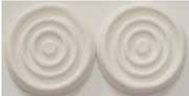
(C/06 Ox. left, C/4 Ox. right)

A plastic low fire smooth body. This potters clay was developed to conform with certain regulations set by the state of Connecticut. Some commercial glazes and underglazes do not fit this body. Standard Ceramics highly recommends testing for glaze and underglaze fit.