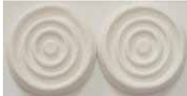
(C/06 Ox. left, C/4 Ox. right)

Same as 105NT with the addition of fine a grog. A toothy clay that many potters prefer.