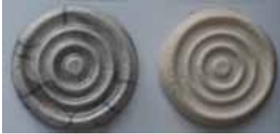
(C/06 Raku left, C/6 Ox. right)

An open clay body specially formulated to withstand thermal shock of Raku firing. Contains sand.