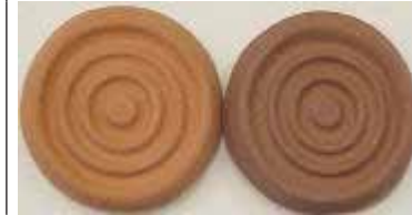
(C/06 Ox. left, C/02 Ox. right)

A low fire body that contains fire clay and a small amount of fine grog. This potters clay is good for the Majolica technique and is a superior throwing body.