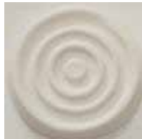
(C/04 Ox. shown)

A plastic low fire smooth body made with Texas talc. This potters clay fires to a very white color and works well with commercial low-fire glazes. It can be used for throwing and handbuilding. Standard Ceramics recommends this body for classroom use.