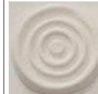
(C/04 Ox. shown)

Same as 105 ceramic clay with the addition of fine grog. A toothy clay that many potters prefer. This potters clay is also a good clay for tile work and larger projects. It gives a slight speckled appearance due to the addition of grog when a transparent glaze is used.