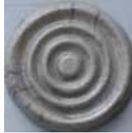
(C/6 Ox. left, C/4 Ox. right)

Good for larger pieces. The addition of kyanite increases the strength of this body.