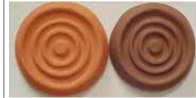
(C/06 Ox. left, C/2 Ox. right)