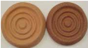
(C/06 Ox. left, C/4 Ox. right)

A versatile clay containing a fine grog. This potters clay is good for hand building, slab work and throwing.