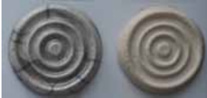
(C/06 Raku left, C/6 Ox. right)

An open clay body specially formulated to withstand thermal shock of Raku firing. Contains sand.